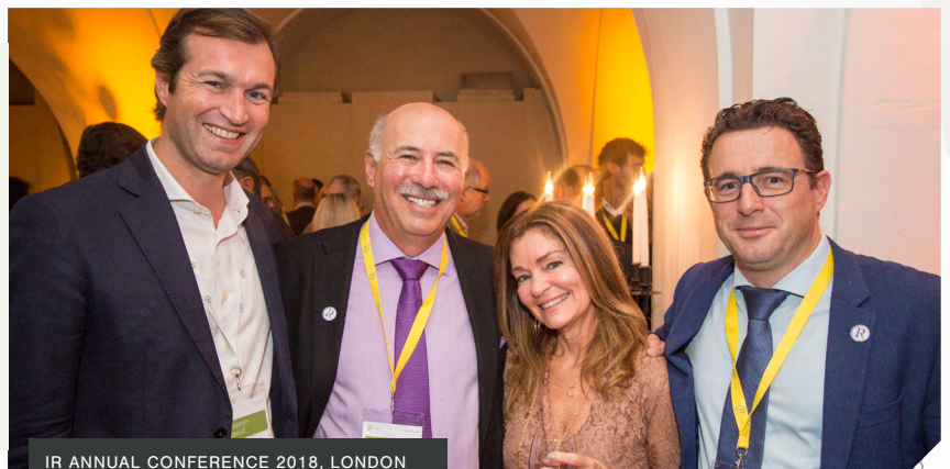
IR ANNUAL CONFERENCE 2018, LONDON